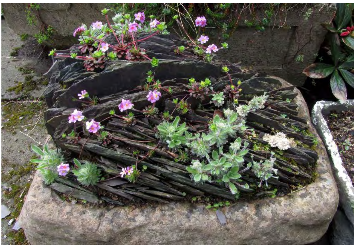
Slate landscaped trough

Androsace sempervivoides Here are some of the cuttings that I placed into pure sand in this slate landscaped trough a few years ago flowering and spreading quite happily.