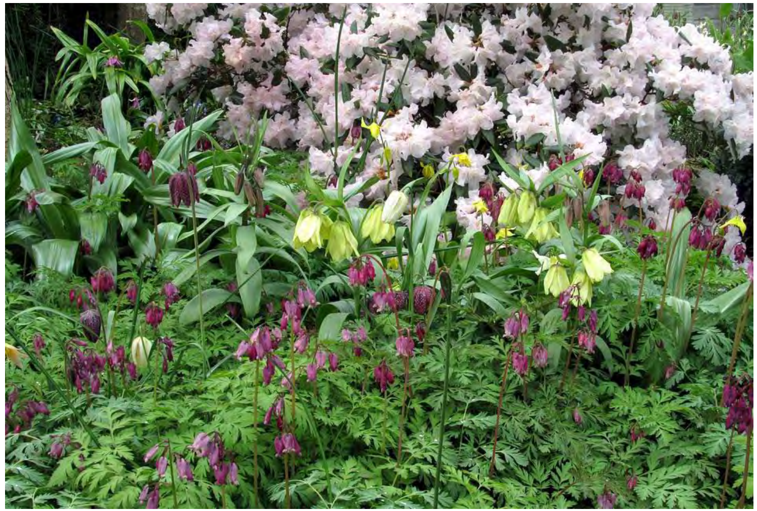
Taller growing bulbs are not only happy to grow up through some ground cover like these Dicentra hybrids but it is partly why they have evolved a long stem with few or no basal leaves.