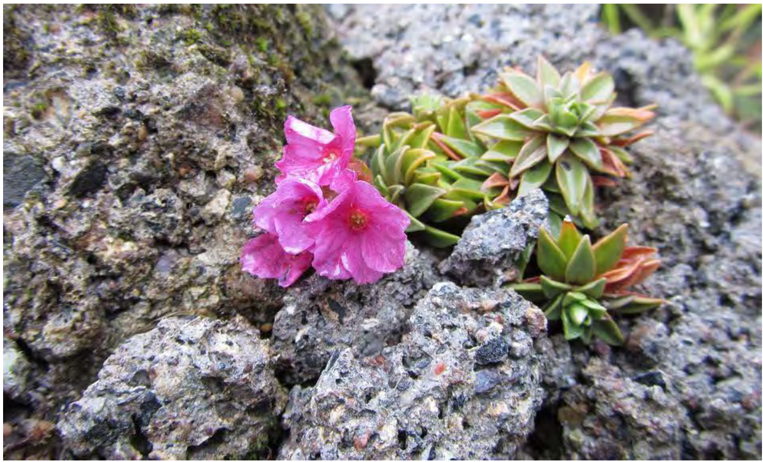
Androsace laevigatus 'Gothenburg'

These two pictures are of young plants planted into another trough just last autumn. This is one of my troughs landscaped with broken concrete building blocks.