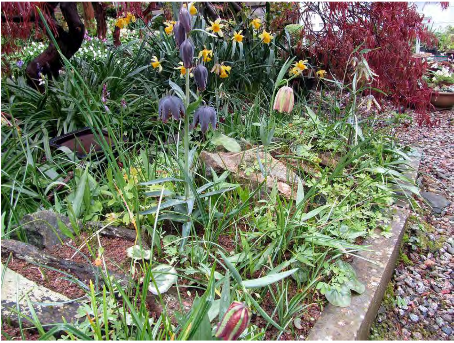
Sand Plunge for bulbs