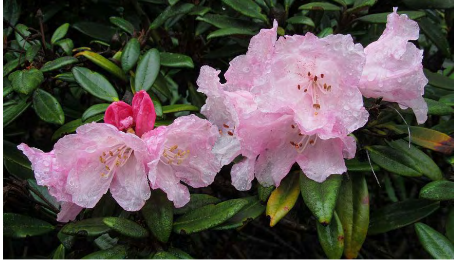
Rhododendron yakushimanum x recurvoides