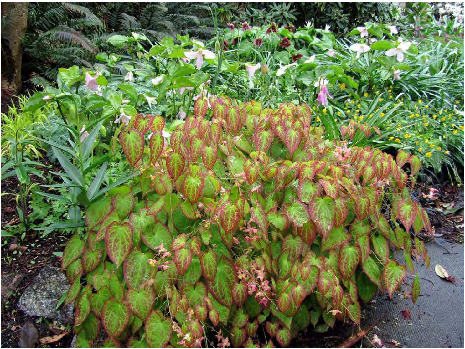
New leaves on the Epimedium are a lovely contrast to the bulbs beyond