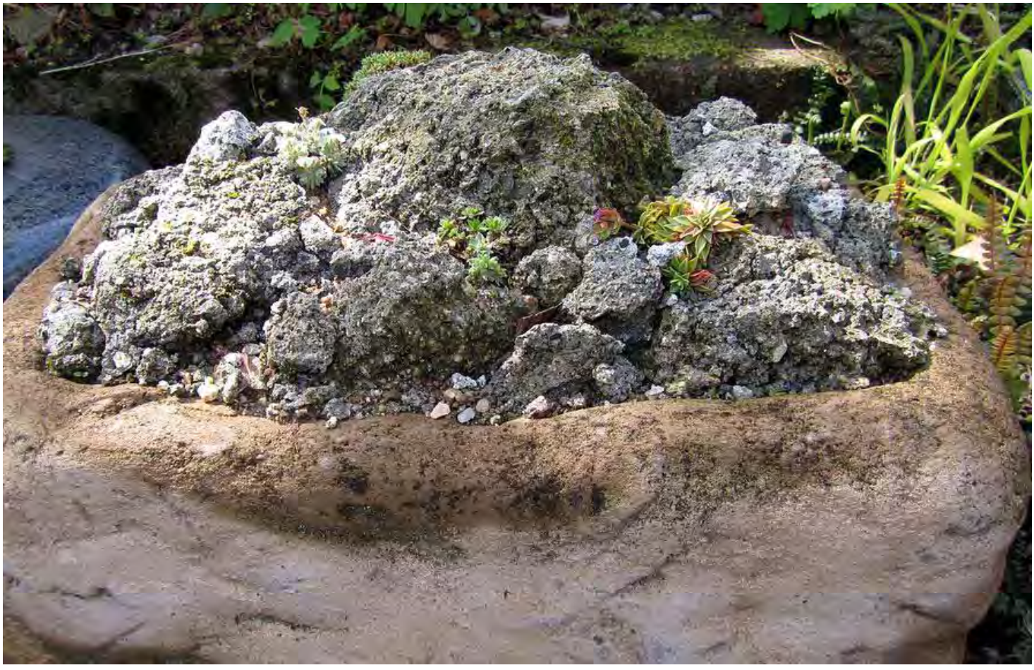
As you can see the plants are perfectly happy with no prejudice against this recycled man made material.